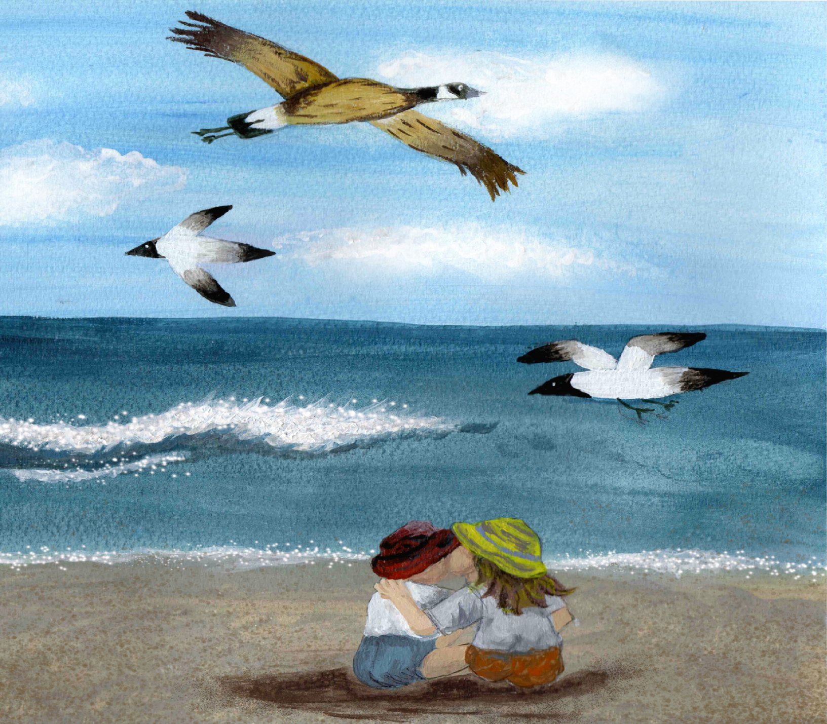
The floating birds